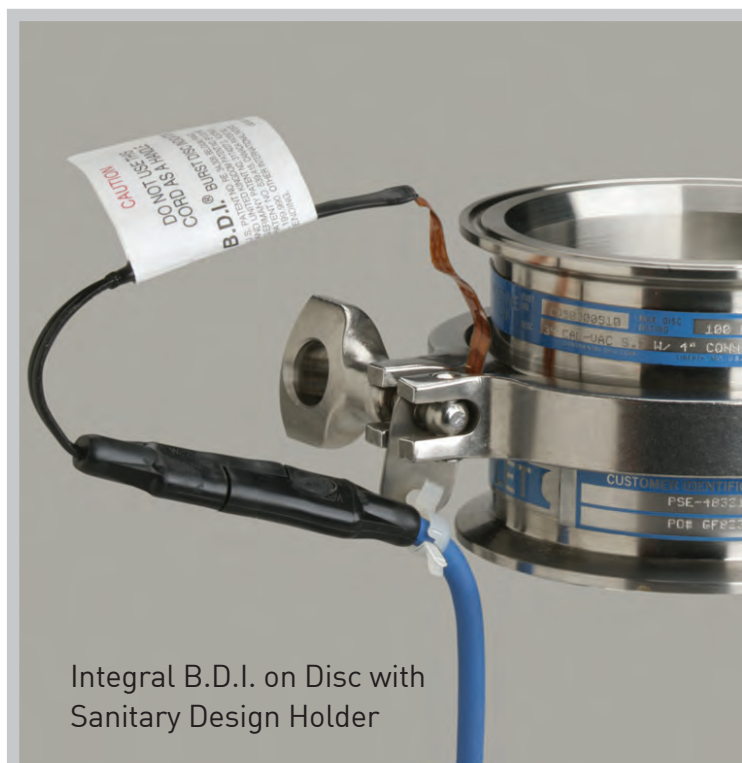
Integral B.D.I. on Disc with Sanitary Design Holder